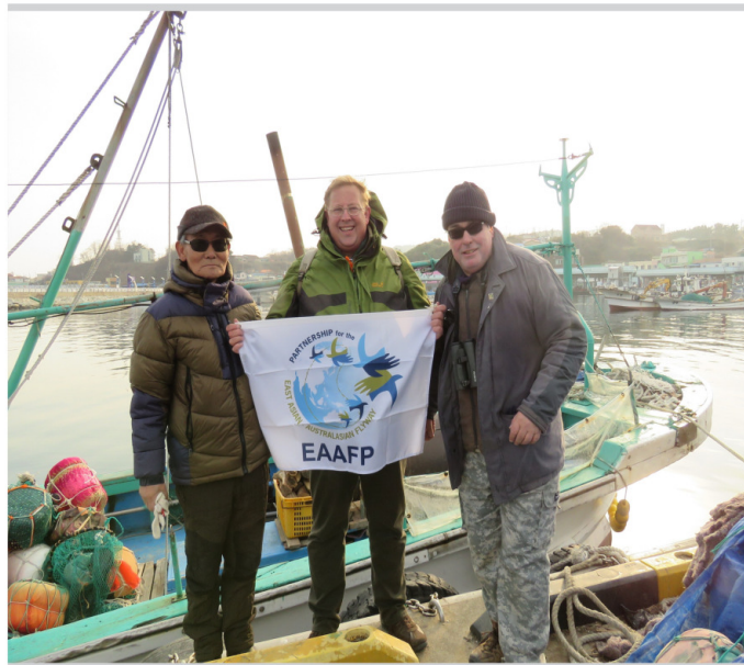
Hanns Seidel Foundation Korea

A JOINT RESEARCH PROJECT OF HANNS SEIDEL FOUNDATION KOREA AND BIRDS KOREA